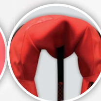
Soft Neoprene Material